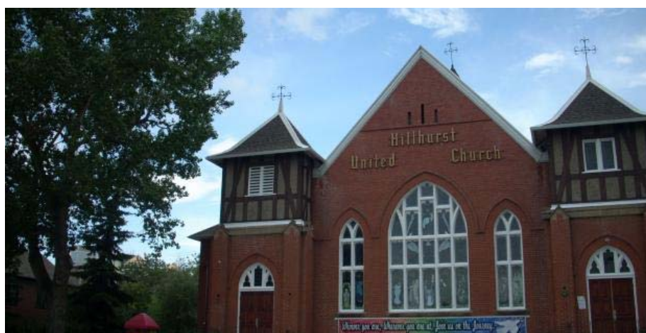
Hillhurst United Church hosts plays and was a venue for this year's Sled Island music festival.