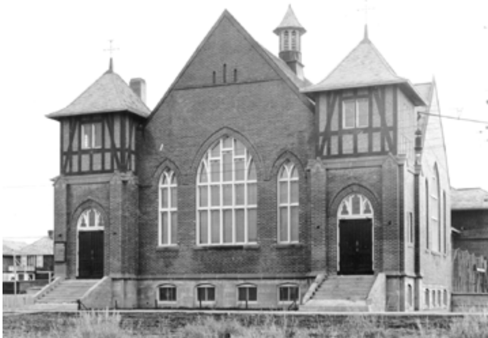
NEW PRESBYTERIAN CHURCH - 1913