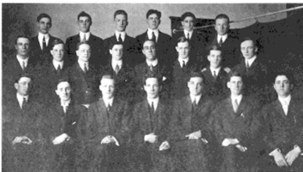
THE CRUSADERS - YOUNG MEN'S CLASS