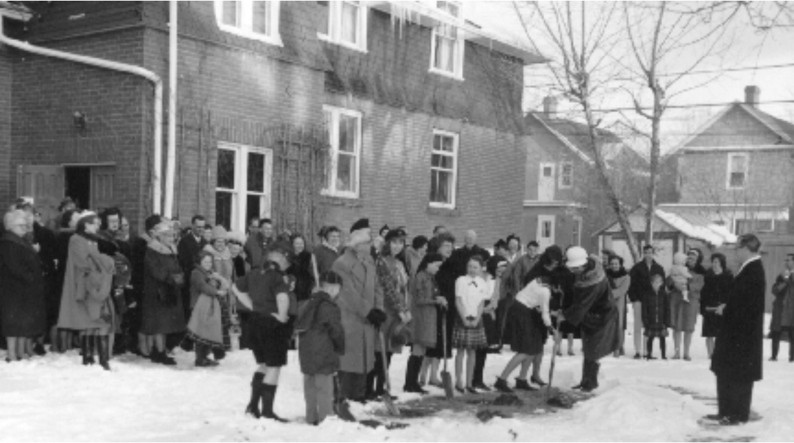
TURNING THE SOD March 19, 1965