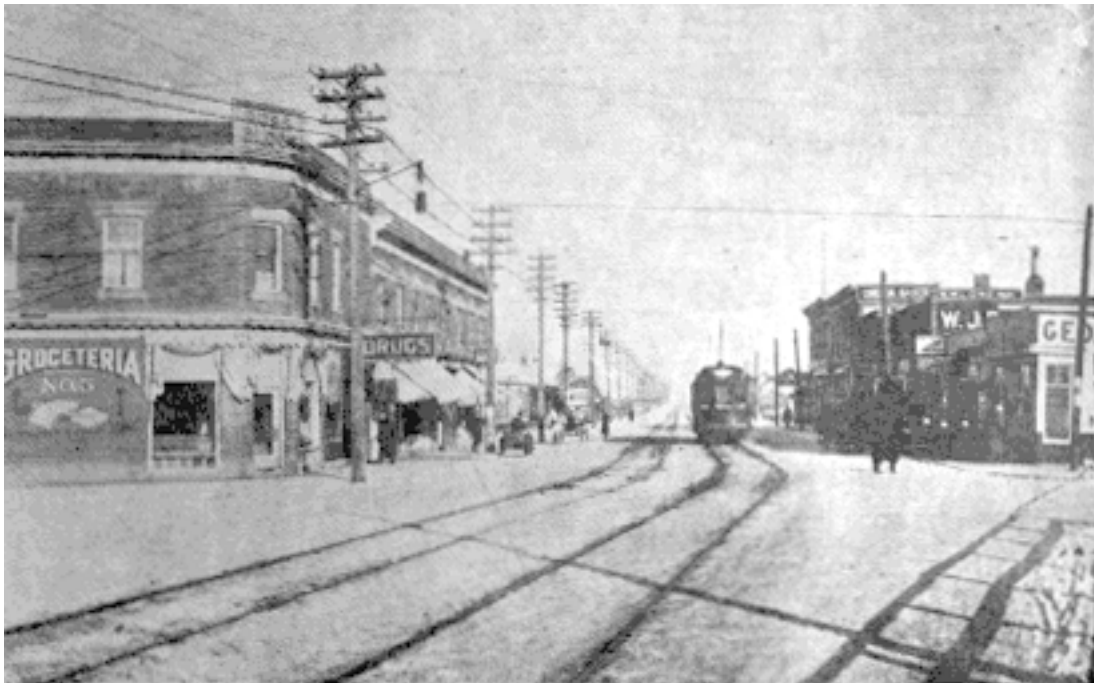
HILLHURST BUSINESS SECTION - 1920 10th Street N.W. and Memorial Drive