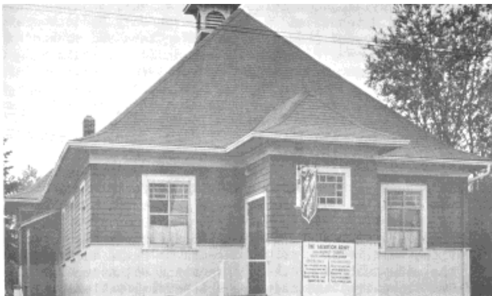
HILLHURST PRESBYTERIAN CHURCH First building at 1127 Kensington Rd. (afterwards Hillhurst Salvation Army)